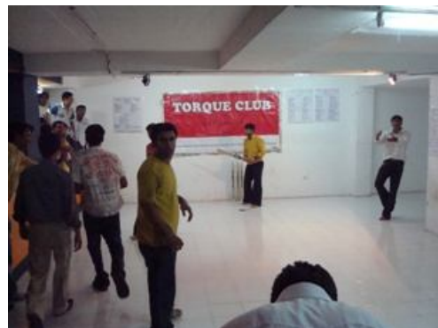
“Boys playing Cricket in our very own field