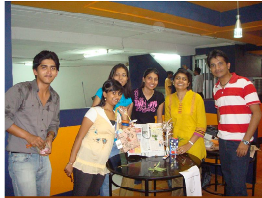
Students creativity in “Best our of Waste” “Enthusiastic 1 st Trimester Students with their Creation of Bags.”