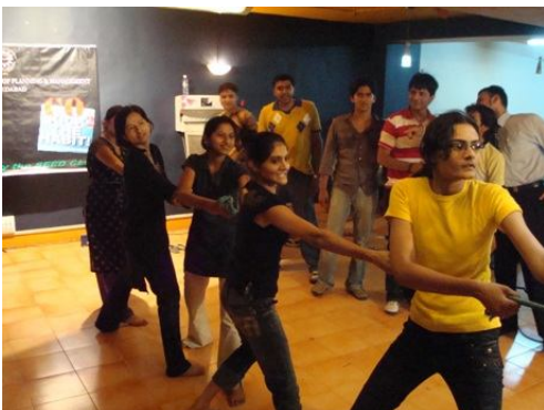
Gal power in “Tug of War” canteen”